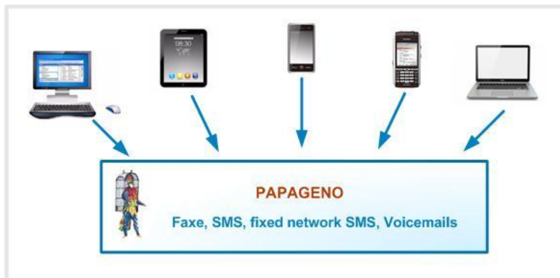
Illustration: PAPAGENO links all messages types. Users can work with any device and different applications.

PAPAGENO can be integrated into your existing environment completely; no matter whether into your mail system like all SMTP compatible systems, Exchange, or into your ERP system. The users do not have to work with new user interfaces, but can continue to work with their known environment. The difference is only in the expanded functionality that PAPAGENO adds. You do not have to compromise regarding operating systems with PAPAGENO, either. The PAPAGENO Unified Messaging Server runs on Windows, Unix, Linux, and also in heterogeneous environments.